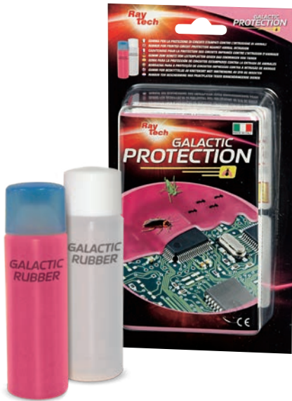
Kit composition: One bottle for component (A+B)

Protection for printed circuits which are especially exposed to dust, animal intrusion (insects, snails, snakes, etc., e.g. in automatic gate trays). Opaque but slightly translucent allows cover forming a protective film. It can be removed (adheres without sticking) even on a small area to access the underlying component. The replaced component is then covered with new filler material which adheres perfectly to the previous material. Composed of two-component rubber with no shelf life and insulating and resistant to UV rays and ageing.