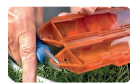
► EASY! Scissors and nothing more!