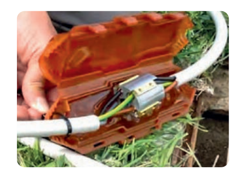
► INTEGRATED SOLUTIONS! HOLE CASING technology - Anti-traction cable system using the supplied cable ties secured to the casing.