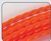
Speedy Helix 4 Polyester Ø 4 mm with eyelet and fixed flexible head